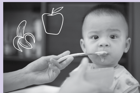
Let me try small pieces of soft or mashed food.

For more information, see the brochure Feeding Your Baby, 6 to 12 months in this mailing. If you have questions about food allergies, talk with your baby's doctor or WIC.